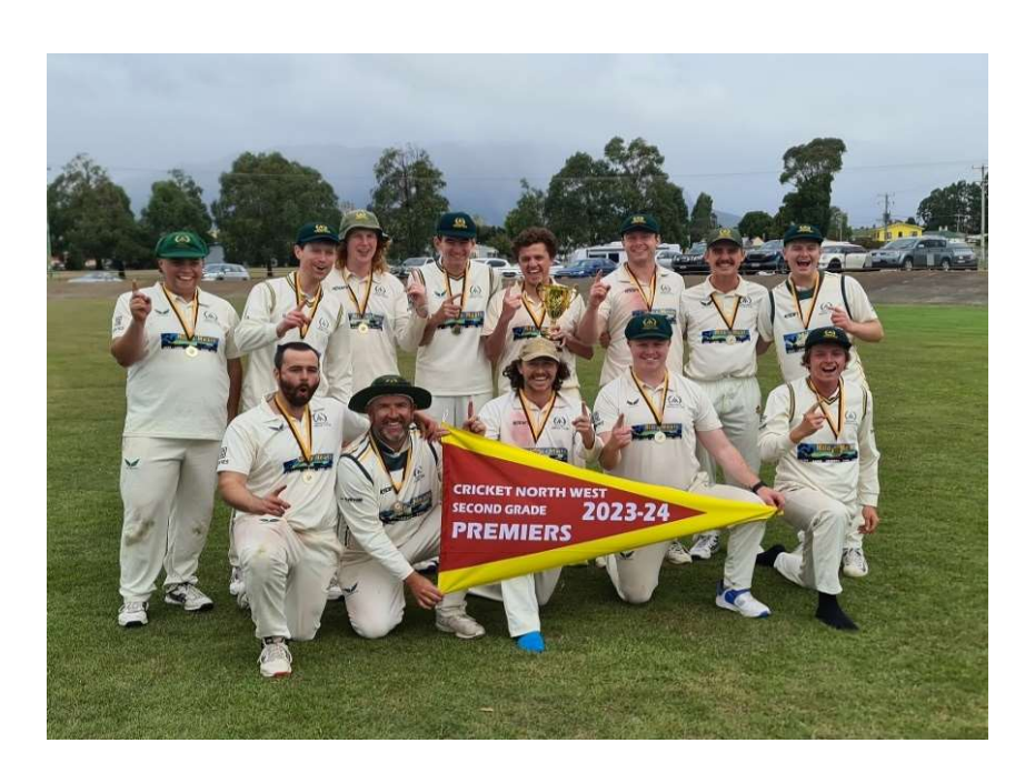
Sheffield – Second Grade Two Day