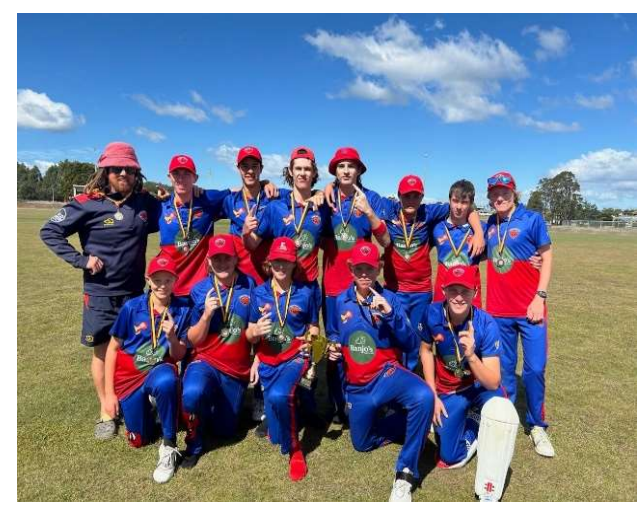
Latrobe – Under-16