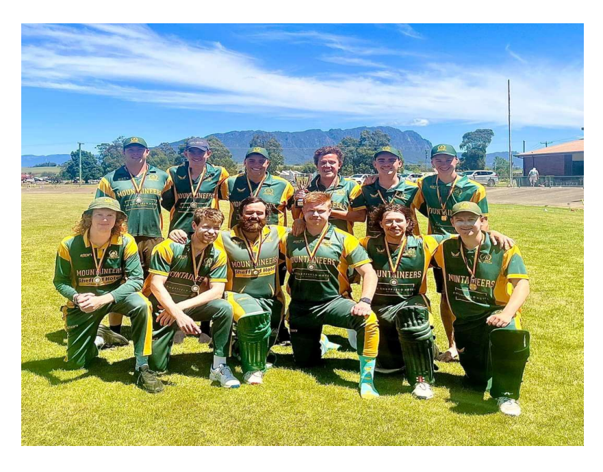
Sheffield – Second Grade One Day