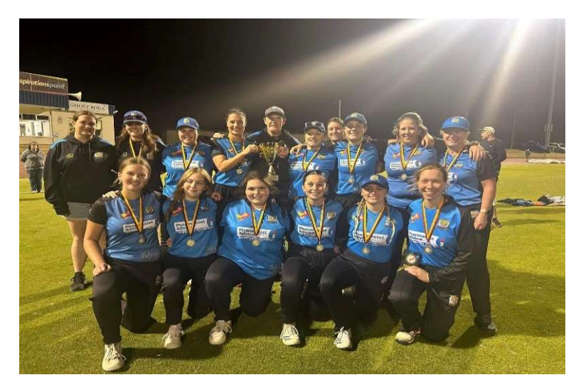
Wynyard – Women's 1st Grade