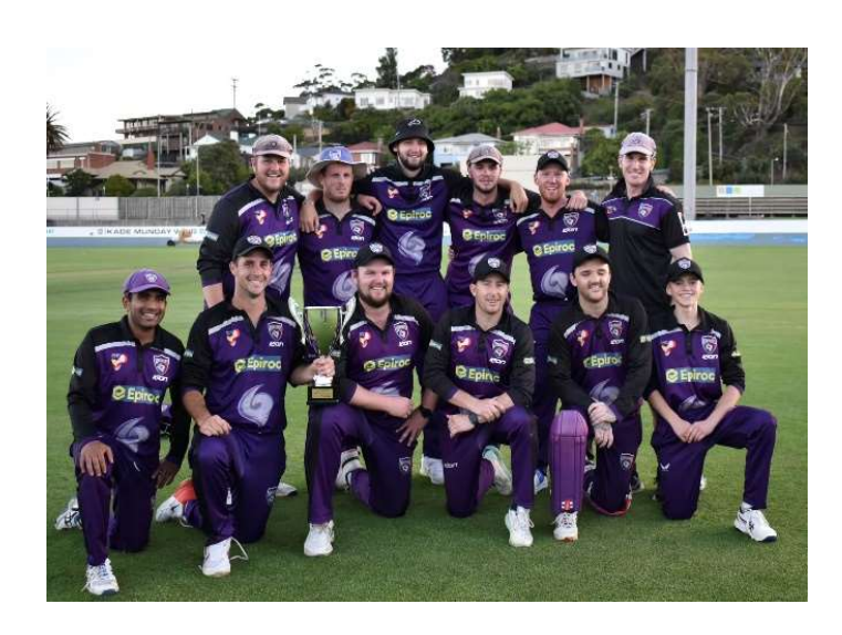
Burnie Hurricanes – T20