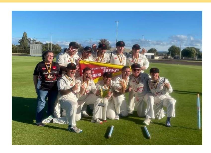
Ulverstone – Men's 1st Grade