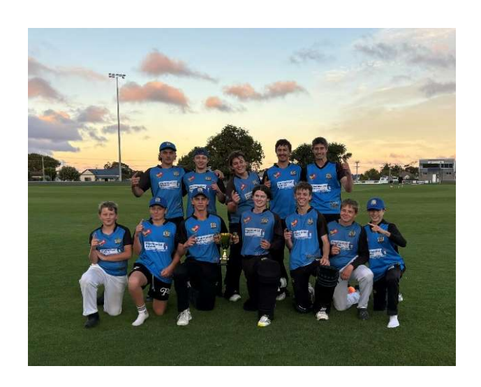
Wynyard – Under-18