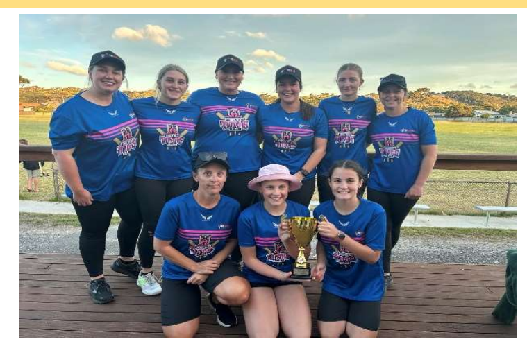
Turners Beach – Women's Social League (Summer)