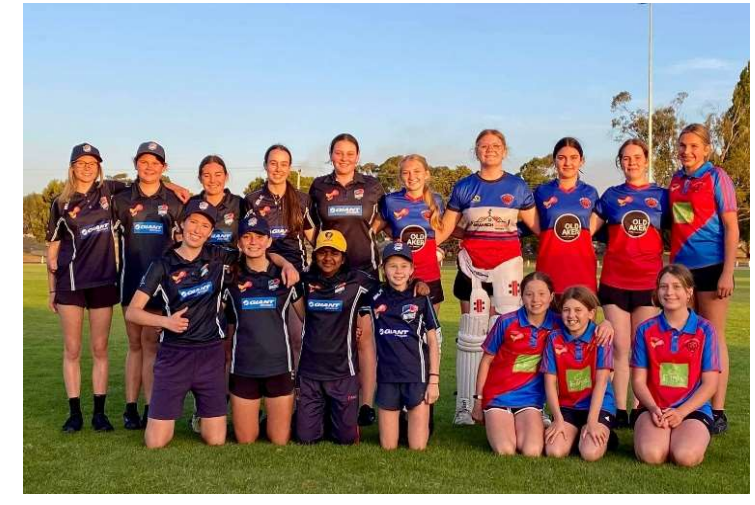
Devonport & Latrobe – Female Development League