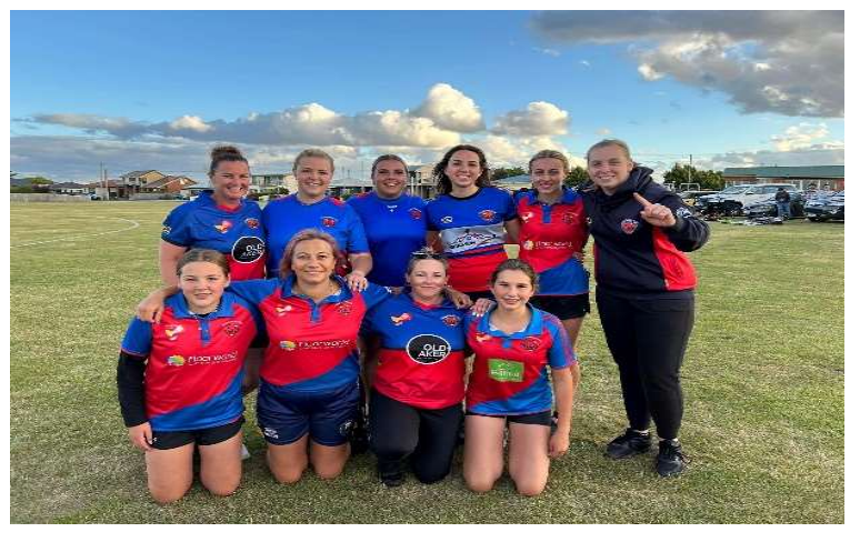
Latrobe – Women's Social League (Summer)